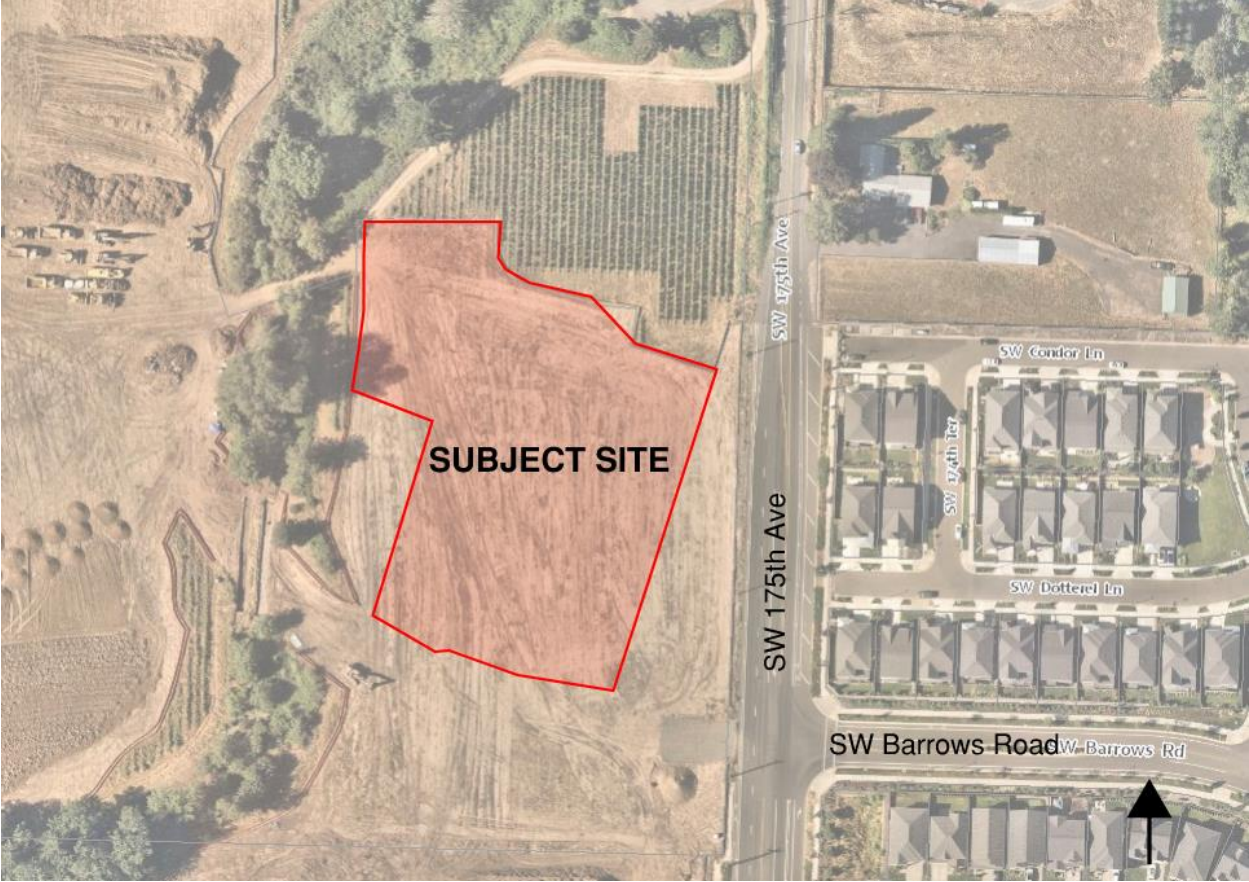
Exhibit 1.1 Vicinity Map